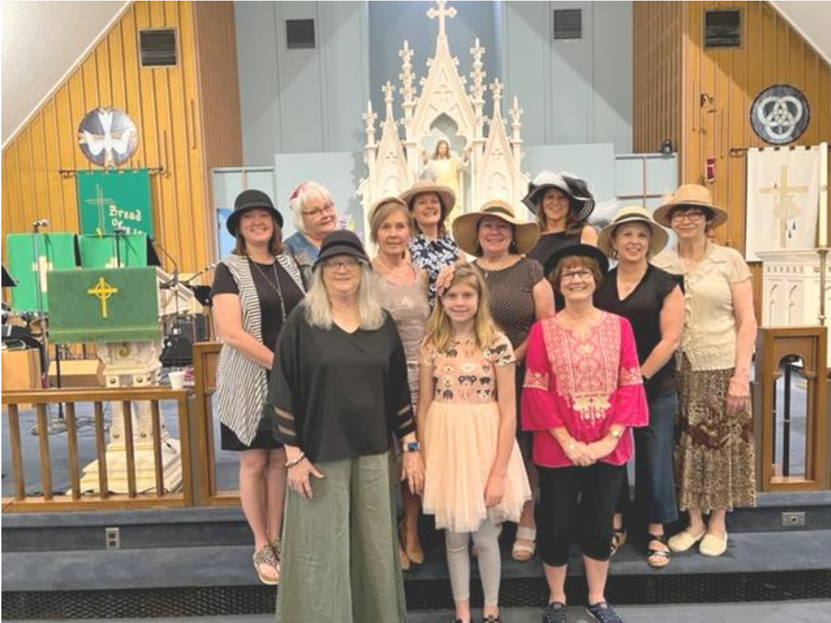
All our ladies enjoying the “Olde Time Religion” worship service with their “Old Time” fashion bonnets!